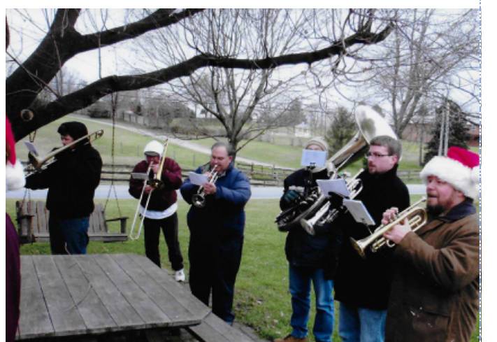
Christmas Caroling - 2011