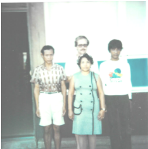
Our Refugee Family - 1978