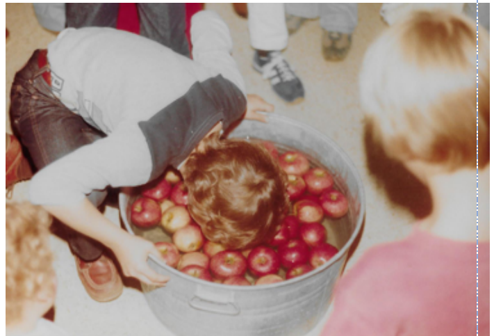
Halloween - 1980