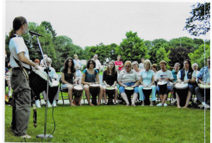
Drum Circle - 2009