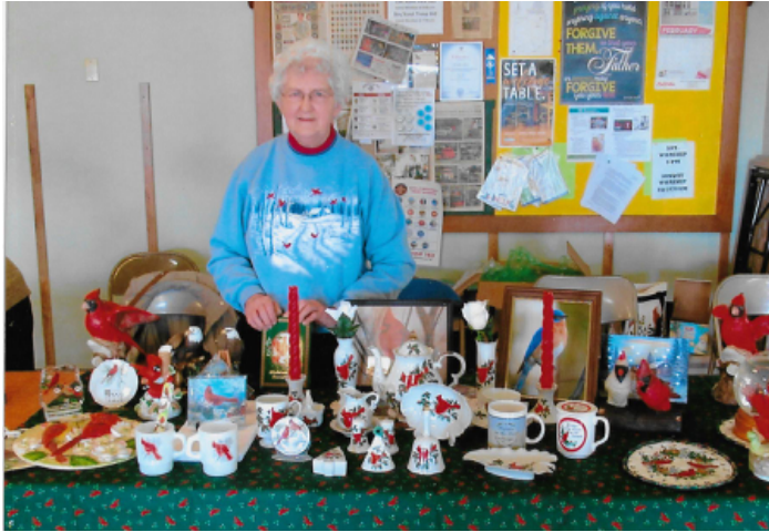
Passion Sunday - 2019