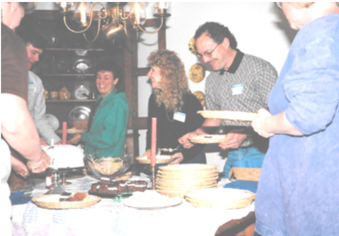
Progressive Dinner - 1999